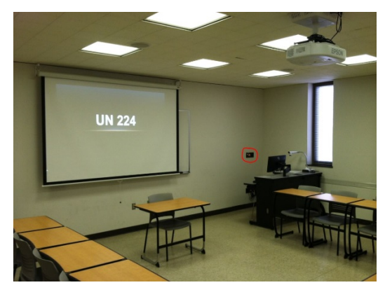
Figure 62 Standard Smart Classroom – Extron panel location

The Extron control panel will be located on the wall behind the instructor's desk in the smart classroom (Figure 12).