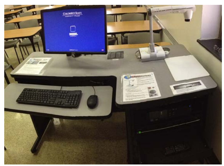
Figure 1 Smart Classroom instructor's desk

Standard equipment in a smart classroom on the CSCC campus are: computer, data projector, DVD/VCR unit, document camera, laptop connection, and a wall panel used to display each unit (Figure 1). The equipment is housed in the instructor's desk located at the front of the classroom. The computer monitor is mounted to an adjustable arm that can accommodate sitting or standing instruction. The computer's keyboard rests on an adjustable tray that also accommodates sitting or standing.