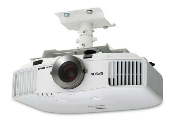
Figure 7 Mounted Data Projector

The panel works in conjunction with the mounted data projector (Figure 7) as it standardizes the controls for all technical equipment in the classroom allowing for easy switching of displays. The panel's illuminated button controls makes it convenient for the user to see what device is currently being displayed. Because the buttons illuminate, they are helpful for presenters in low-light environments (extron.com).