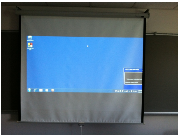
Figure 17 Projector displaying half image