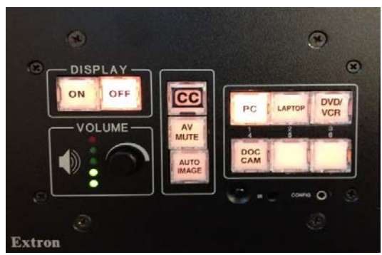
Figure 6 Smart Classroom Extron Control Panel in the powered off state; PC is selected as the current display

The Extron control panel (Figure 6) is the control panel for controlling audio/video equipment displays in Columbus State Community College's smart classrooms.